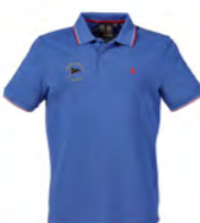
MEN'S MILES TIPPED POLO DAZZLING BLUE Was $105 Now $52.50