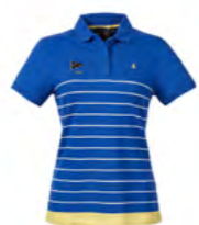
LADIES' BIARRITZ STRIPE POLO DAZZLING BLUE Was $90 Now $45