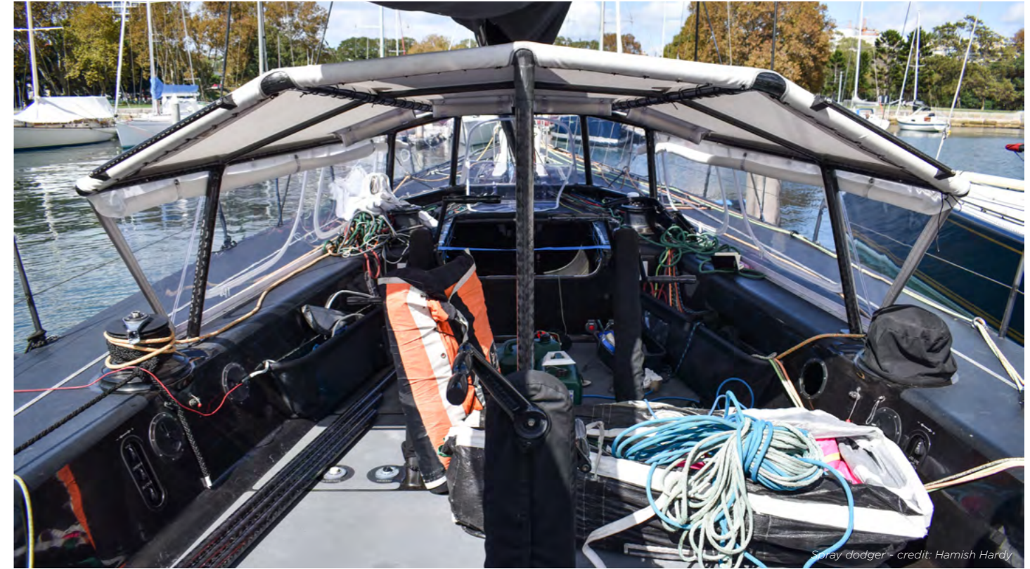
Spray dodger

Sail handling is number two. We put torsional head stays on the boat, which means we have three jibs; the masthead, a main jib, and then a staysail. They're all furling so you can furl and unfurl a jib from the pit, and with changes in wind speed, that's a big change in power.