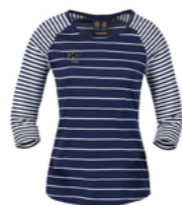
LADIES' LUCIA 3/4 SLEEVE STRIPE TEE PEACOCK WHITE Was $90 Now $45