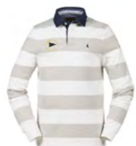
MEN'S EDWARD RUGBY GREY MARL Was $165 Now $82.50

CYCA Merchandise available from shop.cyca.com.au