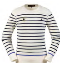
MEN'S MONACO STRIPE KNIT ANTIQUE SAIL WHITE Was $165 Now $82.50