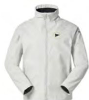
MEN'S EVOLUTION CREW JACKET PLATINUM Was $220 Now $110