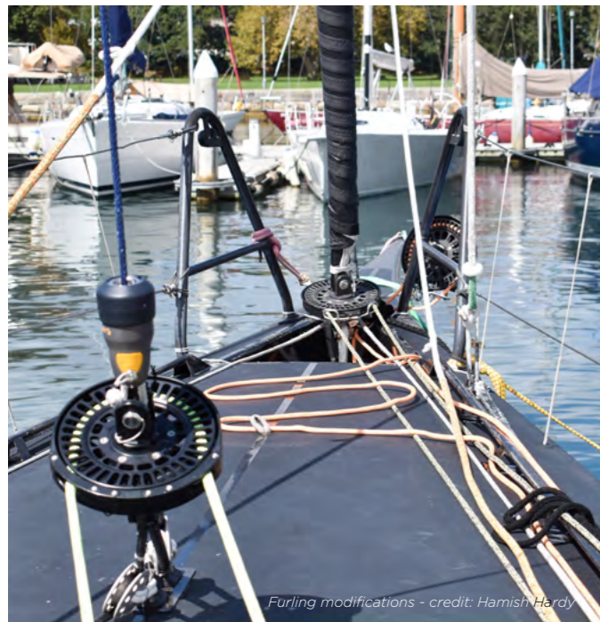
Furling modifications

RH: The organizers say, "finishing it is winning it." I reckon we just try and finish first, and let the boat work its magic. It's a really fast boat, so if we get decent weather, and finish it, we should do all right.