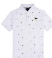
MEN'S SCATTERED POLO WHITE Was $95 Now $47.50