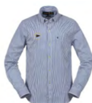
MEN'S BRAYDON L/S STRIPE SHIRT TRUE NAVY Was $115 Now $57.50